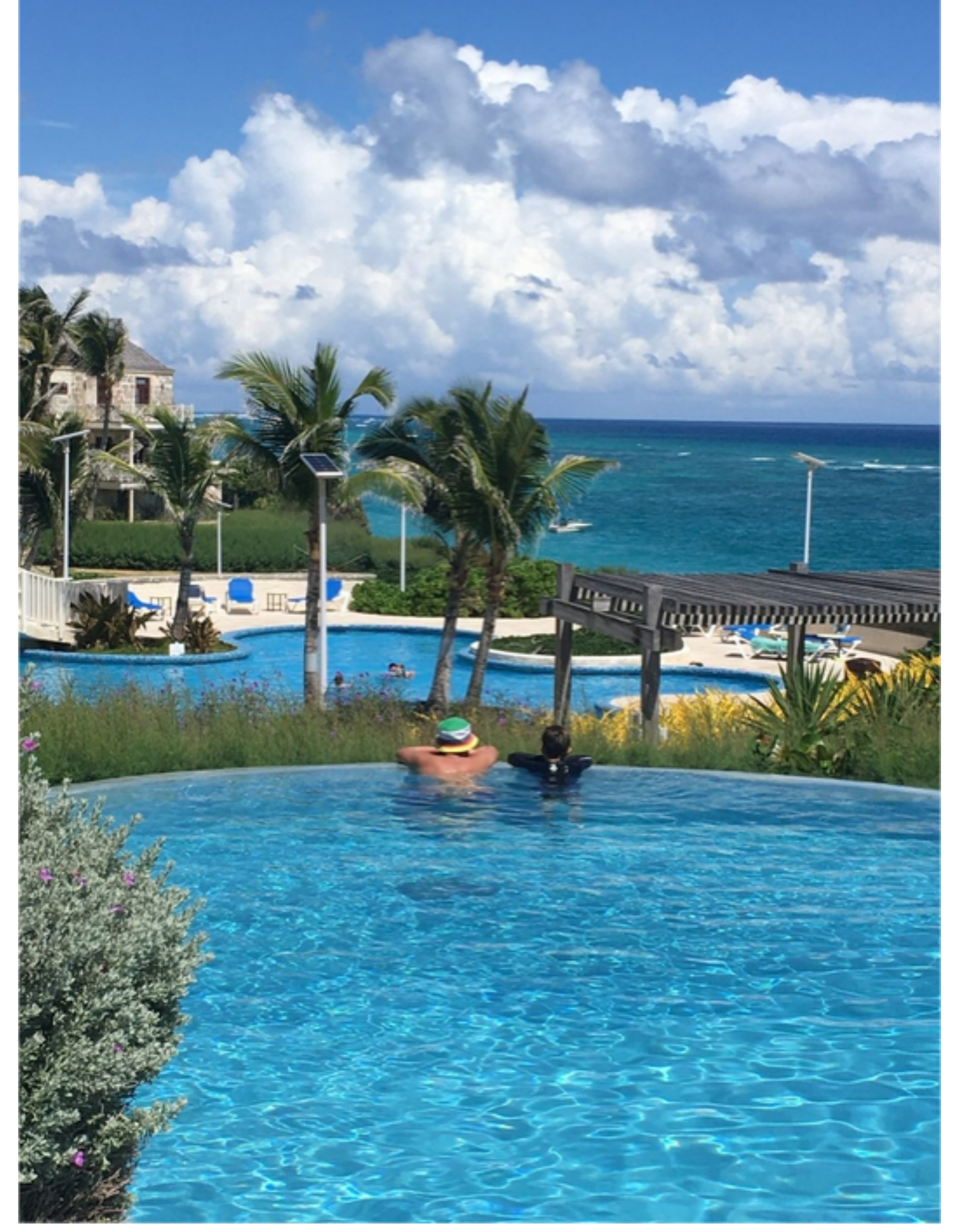
The colour blue pops at the Crane Resort on the southeast coast of Barbados.

"What I think sets us apart from other people in the region, not just Barbados, is the emphasis on community and community amenities — like restaurants and the fitness centre, spa, tennis courts — it's getting together."