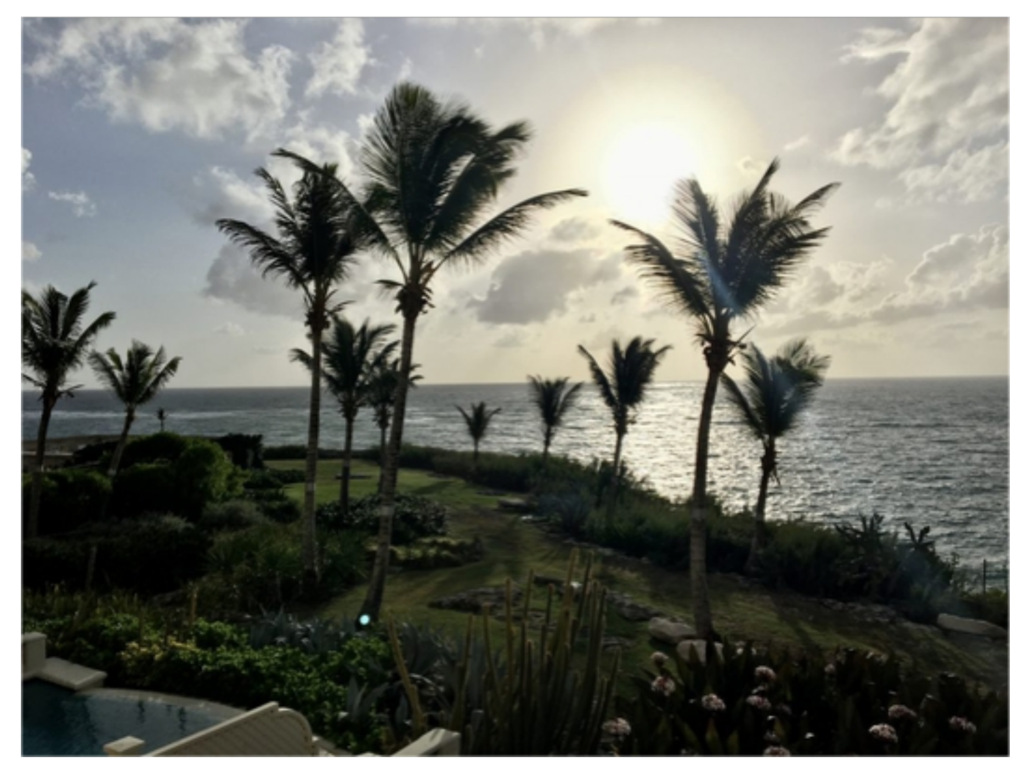
Watching the sun rise from a room at the Crane Resort in Barbados as the waves roll in from Africa. (Cynthia McLeod/Toronto Sun) (Cynthia McLeod/Toronto Sun)

However, when the Marine Villa mansion opened as the Crane Beach Hotel in 1887, there were only 18 rooms.