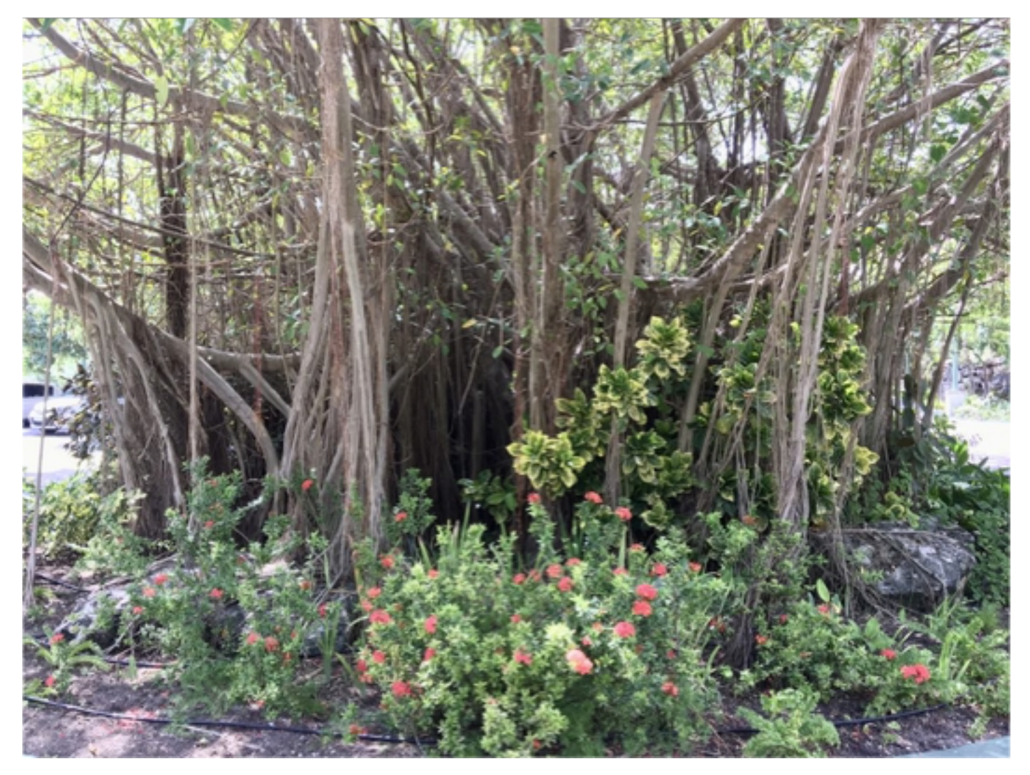
The enormous bearded fig tree in the roundabout in front of the lobby of the Crane Resort in Barbados.

— Guests are greeted by an enormous bearded fig tree in the roundabout outside the lobby, which is fitting as Barbados is believed to have been named after that tree.