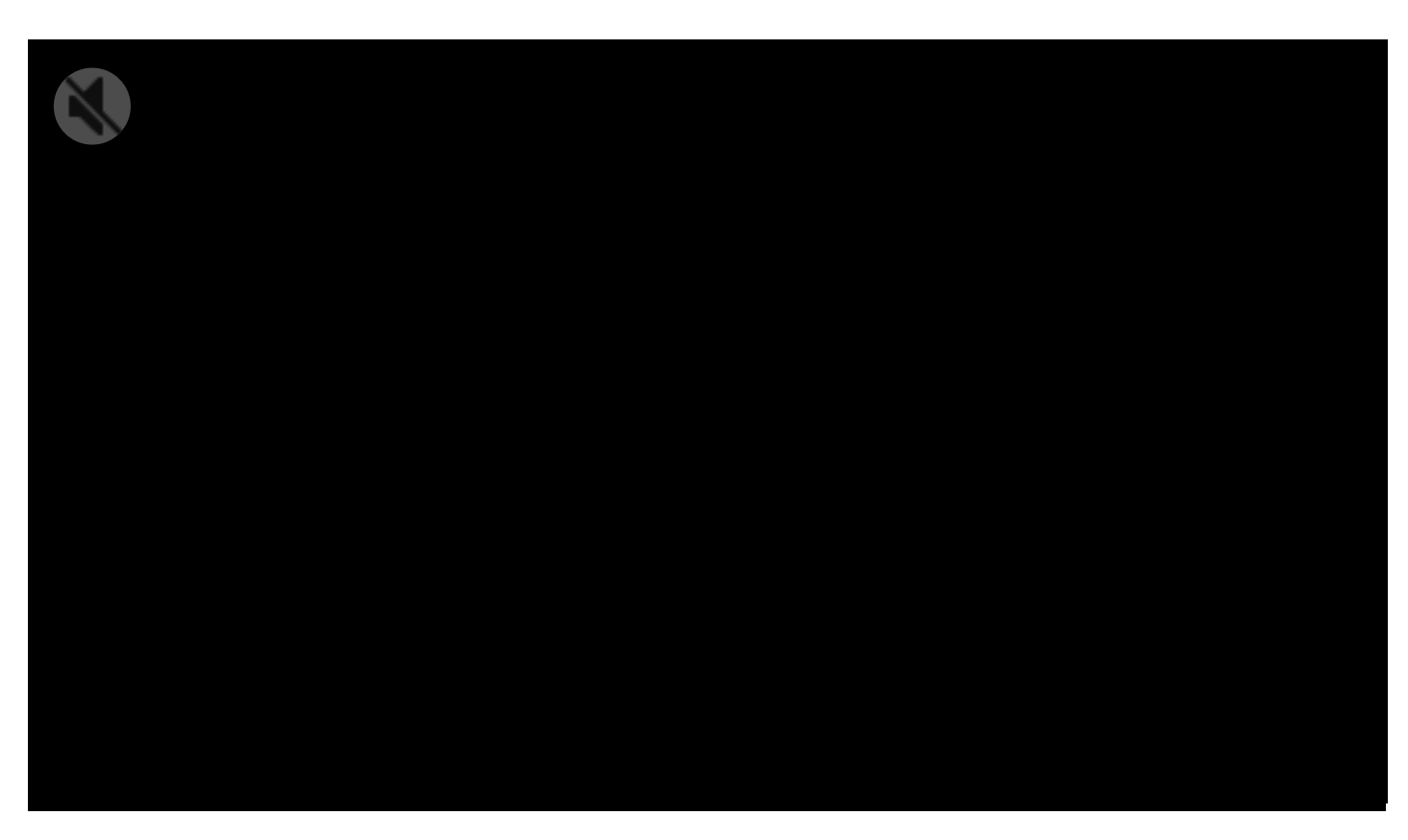
This vista has been drawing guests to this cliff-top oasis on the southeast coast of the island for more than a century.

Gazing out from my veranda at the Crane Resort in Barbados, watching the waves roll in and the palm trees sway in the easterly trade winds, I can almost convince myself I see Africa.