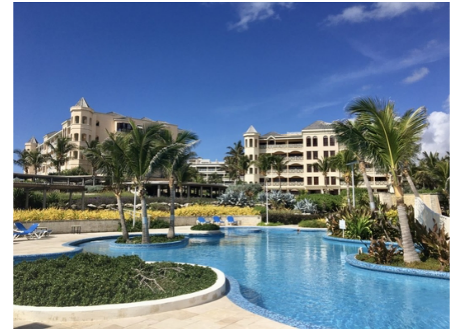
Guest rooms facing the sea look over pools and the original carriage house at the Crane Resort in Barbados.

Cynthia McLeod Jan 11, 2020 • Last Updated 9 months ago • 5 minute read