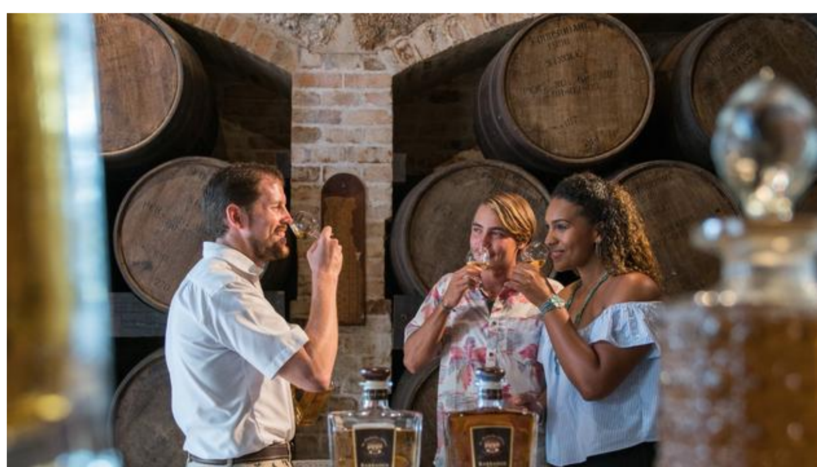
Rum tasting at St. Nicholas Abbey.

DESTINATION & TOURISM | OCTOBER 18, 2020