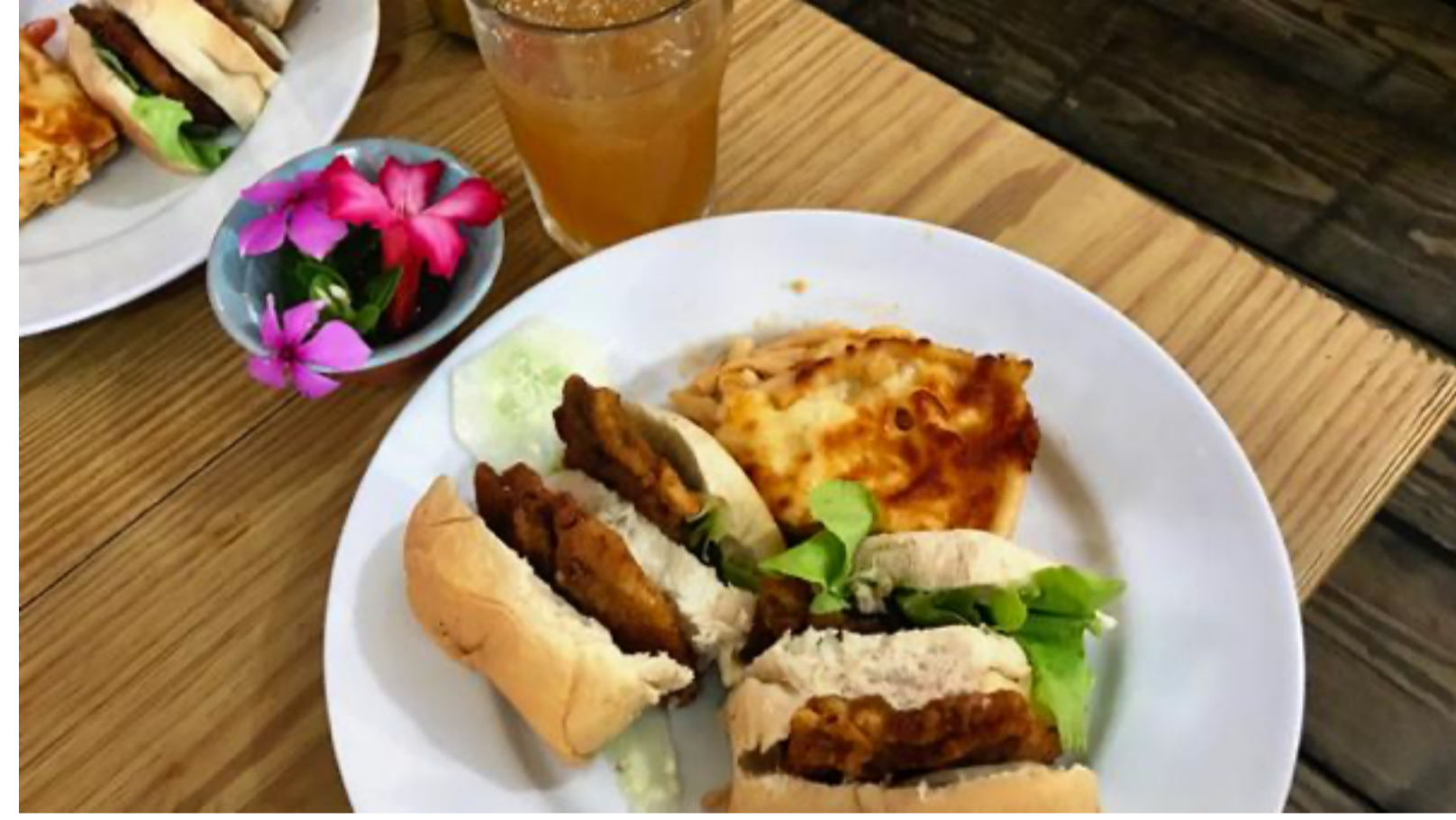
Flying Fish Sandwich and Rum Punch at Cutters of Barbados.

The folks at Lick Rish Food Tours will take you on a lively, fun tour of casual dining spots in Bridgetown. Marina Bar and Restaurant is decked out in Barbados' official colours of blue and gold, with a fine patio overlooking the harbour. Try the corned beef fritters with ginger beer. You also might stop in at Tim's Restaurant and Bar for pigtailed or to a market to try tasty, sweet sorel juice. Along the way you'll learn about the island's colourful history, including slave markets and old Jewish settlements.