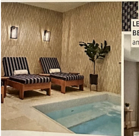
LEFT: The hydrotherapy spa is ideal for unwinding. BELOW: The signature suites have all the amenities of a mini condo.

fireplace, king bed and double vanity. Suites feature cedar-lined closets, Stearns & Foster mattresses and marble-clad bathrooms for a luxurious experience. 124 on Queen also has a wedding event space, and the elegant restaurant, Treadwell Cuisine, serves outstanding local wines. AT YOUR SERVICE: The hotel's 12,000-square-foot spa is the first of its kind in the area. The rejuvenating hydrotherapy circuit includes hot and cold pools, sensory experience showers and a snow "cave." This room offers a meditative experience, gently restoring the body to a normal temperature after a sauna. Coming soon are an outdoor yoga area, spa cabanas and reflecting pools. Rooms from $259/night. 124queen.com.