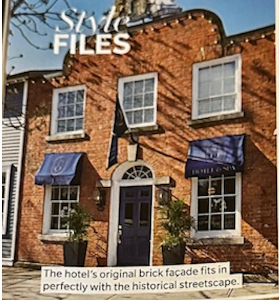
The hotel's original brick façade fits in perfectly with the historical streetscape.