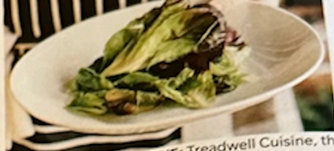
ABOVE: Treadwell Cuisine, the on-site restaurant, features fresh, farm-to-table fare from Niagara producers. BELOW: The lobby has a sleek, contemporary feel.