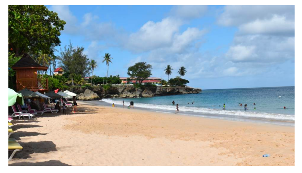
Store Bay is one of the main tourist attractions and destinations in Tobago. The island has numerous hotels and resorts owned by women.

Onemantobagoarmy Cuffle River Nature Retreat and Eco-Lodge