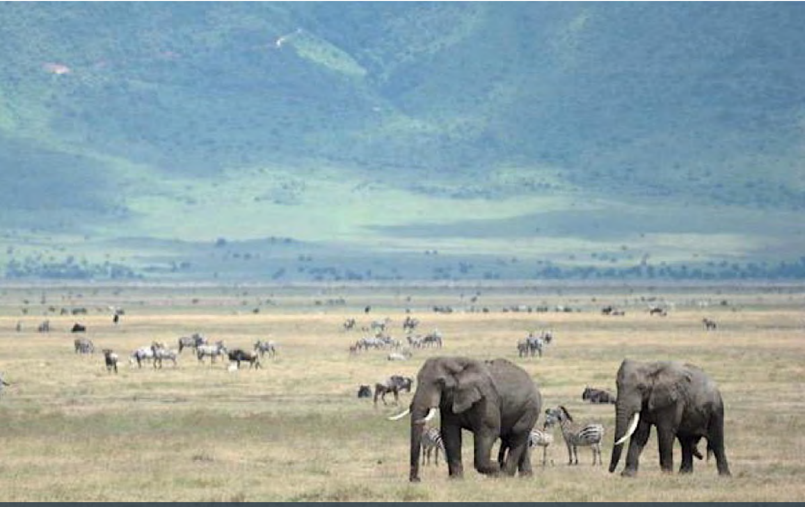
ToursByLocals has introduced a new safari product.