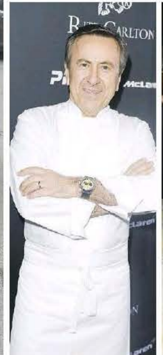
Chef Daniel Boulud