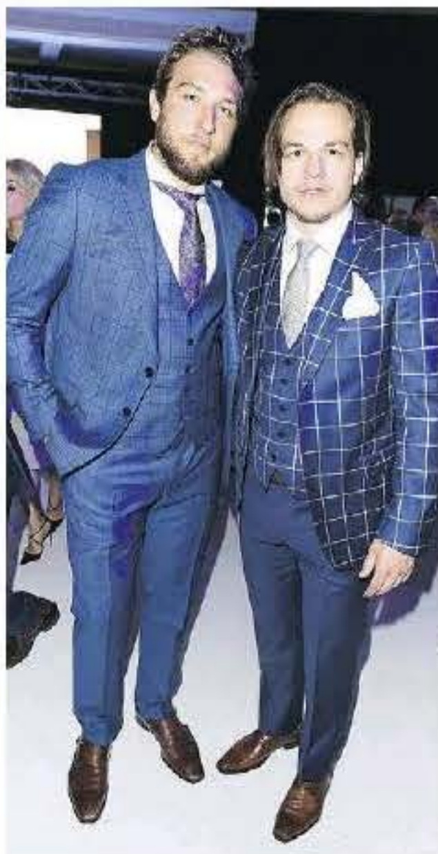
Stefan Matteau and Sven Andrighetto