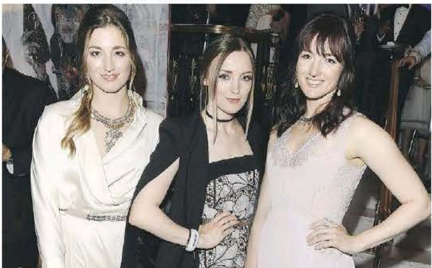
Chloe Dufour-Lapointe, Justine Dufour-Lapointe and Maxime Dufour-Lapointe