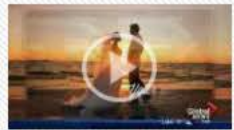
AMA Travel: Destination Weddings