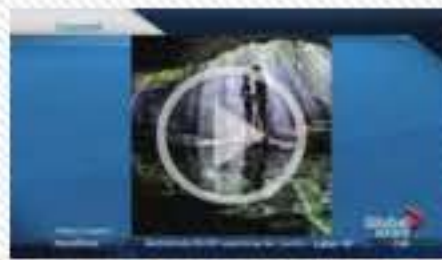
Destination wedding planning