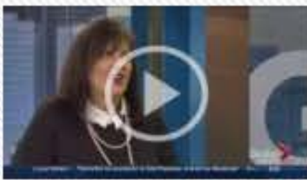
Top destination wedding locations