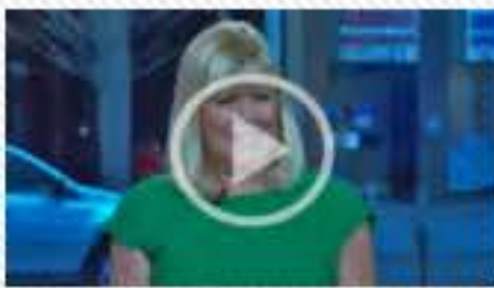
Spring Destination Weddings