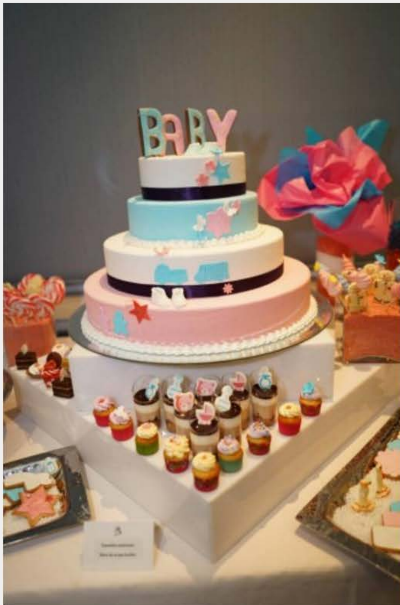
The perfect cake for a baby shower, photo by Moetreal.

Outside, the Palm Court was warmly decorated and smelled like fresh perfume. A huge painting of Artemis the huntress looked over the sharply dressed guests who chatted and stared up at the ceiling's painted palm leaves.