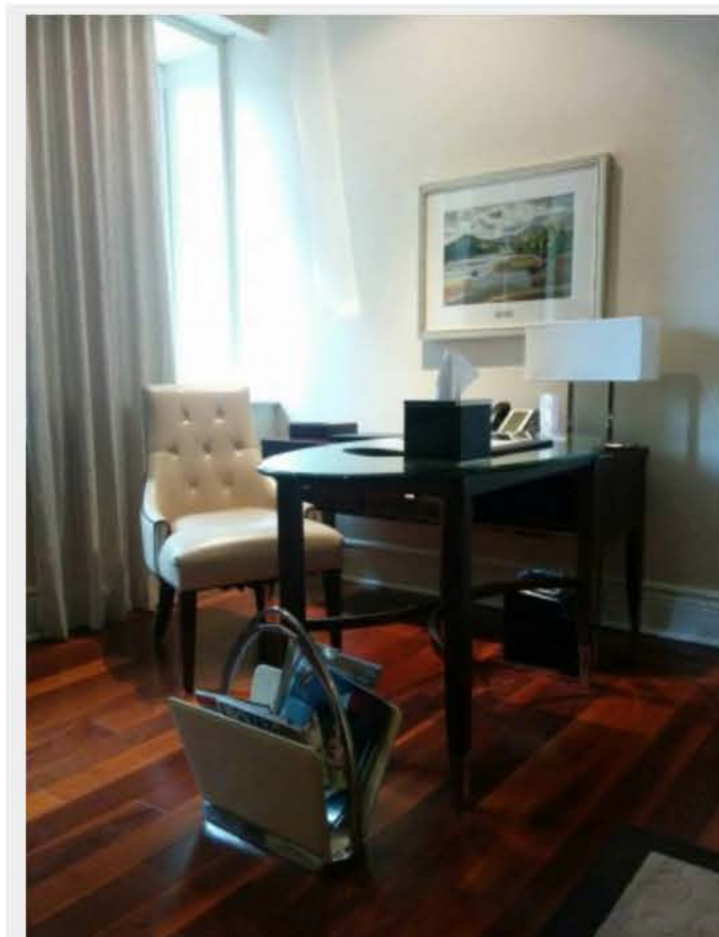
The room really was perfection.

The technology didn't take away from the suite's elegance one bit, or detract from its early 20th century aesthetic. The room exuded understated luxury. Its king-sized bed was beautiful but cozy, with a powder-blue couch at its foot.