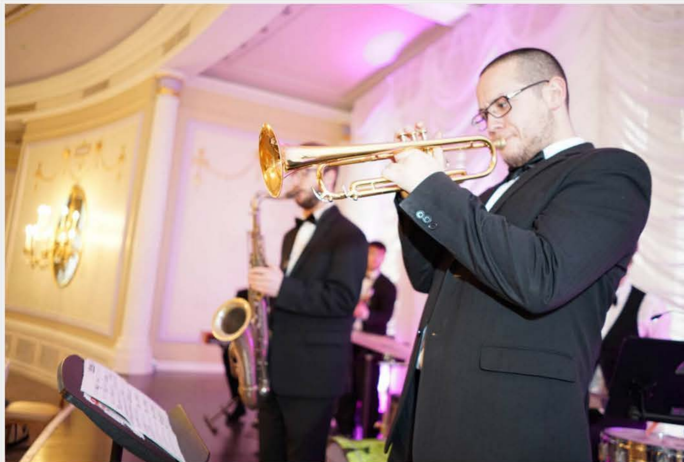
Liquor Store, the Jazz Band.

It was hard for us to tear ourselves away from the gorgeous room, but after a few hours we wanted to see at least a little bit of Old Montreal. We walked down some of the narrow streets and found a fabulous restaurant called Les Pyrénées that had a fantastic veggie burger and borderline-telepathic servers.