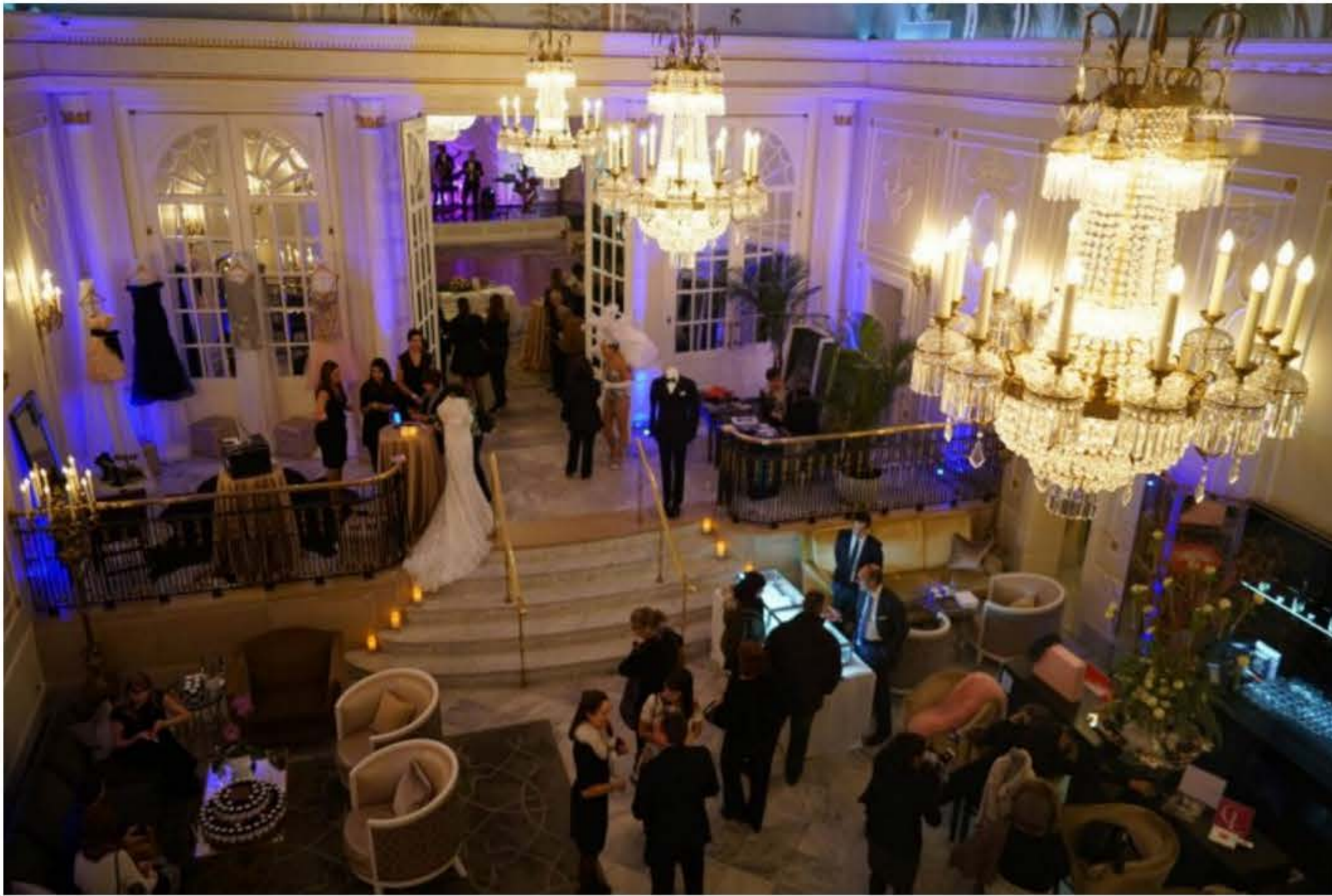
A view of the Palm Court, leading into the opulent Oval Room.