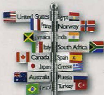
ICE - INTERNATIONAL CURRENCY EXCHANGE

orders in person. Benefits include ICE's TravelCash Guarantee, no service charges and free buy-back service. The TravelCash Guarantee gives Click & Collect customers access to ICE's lowest exchange rates. In addition, the bilingual specialists at ICE's signature Currency Concierge Team (accessible toll-free, seven days a week) provide currency expertise and customer support. clickandcollect.ca