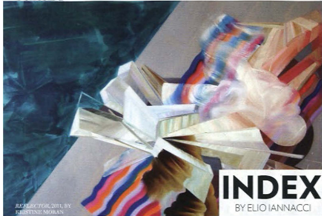
REFLECTOR, 2011, BY KRISTINE MORAN