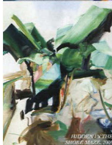
HIDDEN IN THE SHORE MAZE, 2009