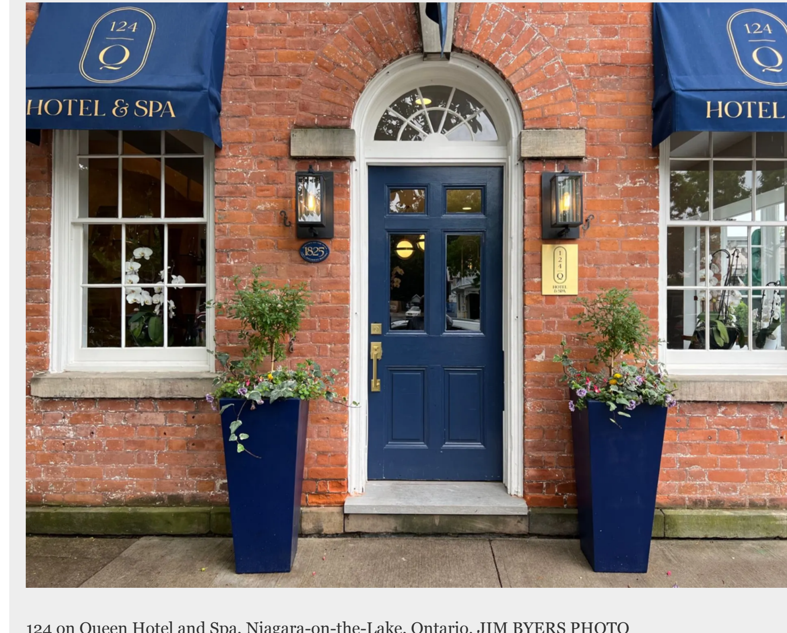
124 on Queen Hotel and Spa, Niagara-on-the-Lake, Ontario.

An afternoon at the luscious ScandinaVe Spa is a great way to spend time with your honey. It's super romantic to sit in a warm/hot outdoor pool and watch the snowflakes fall all around you. Take a walk through the pedestrian-friendly village and find that perfect spot for a quiet dinner. Top hotels include the Fairmont Chateau Whistler and the Four Seasons.