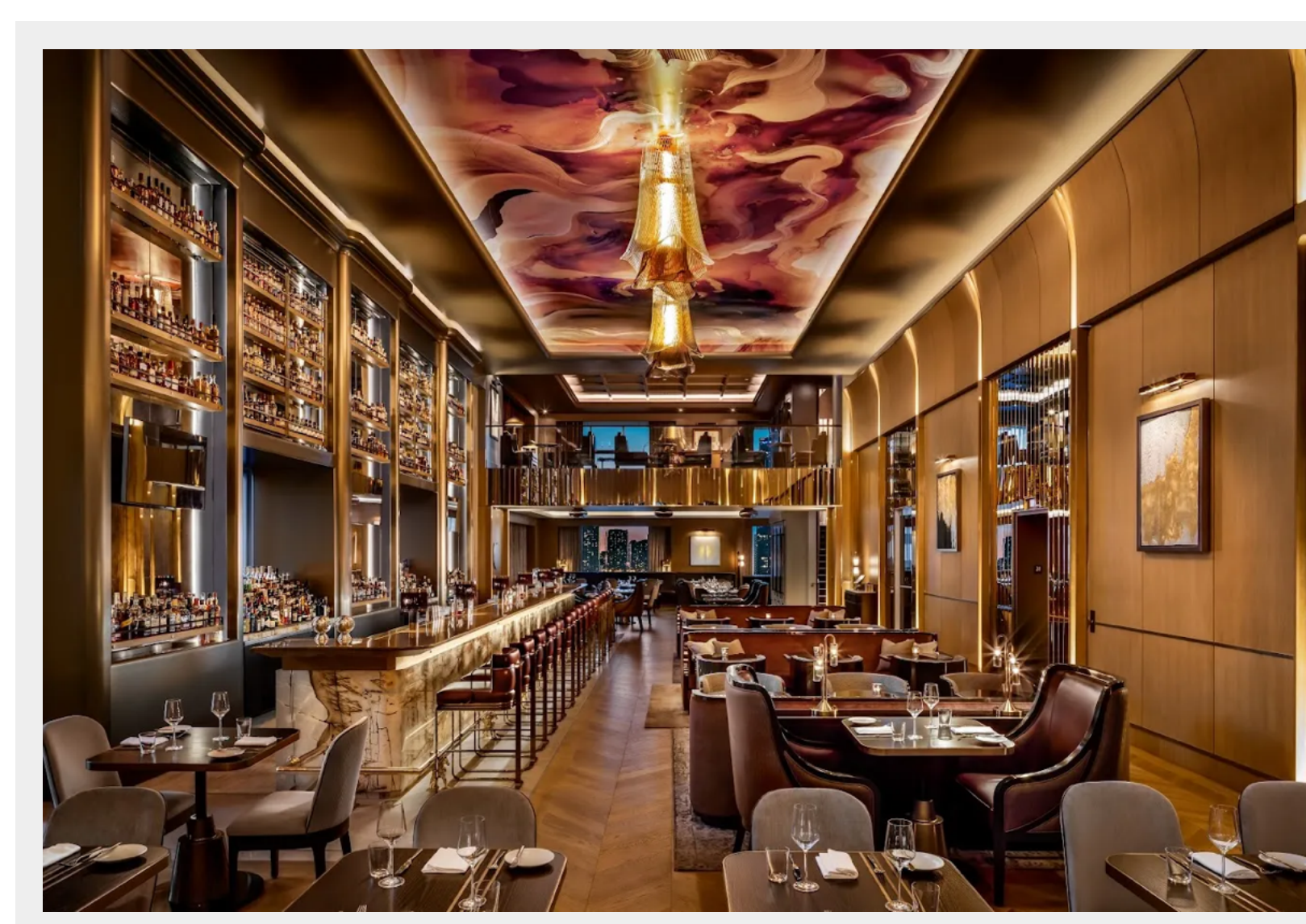
Louix Louis restaurant at the St. Regis Hotel, Toronto.