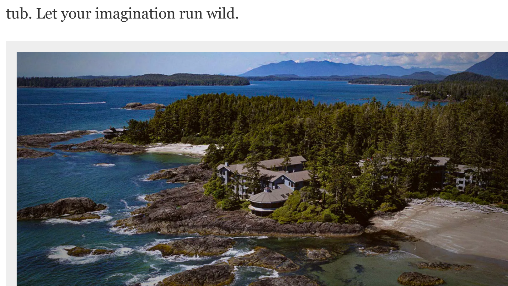
The Wickaninnish Inn is one of the great spots to stop in the Tofino, B.C. area.

This is one of my fave cities in Canada. There are great restaurants to take your sweetheart to for a fine meal, including the cozy Mallard Cottage in Quidi Vidi village. The stylish ALT Hotel on the waterfront won't break the bank. The Murray Premises hotel has some rooms that feature a giant hot tub. Let your imagination run wild.