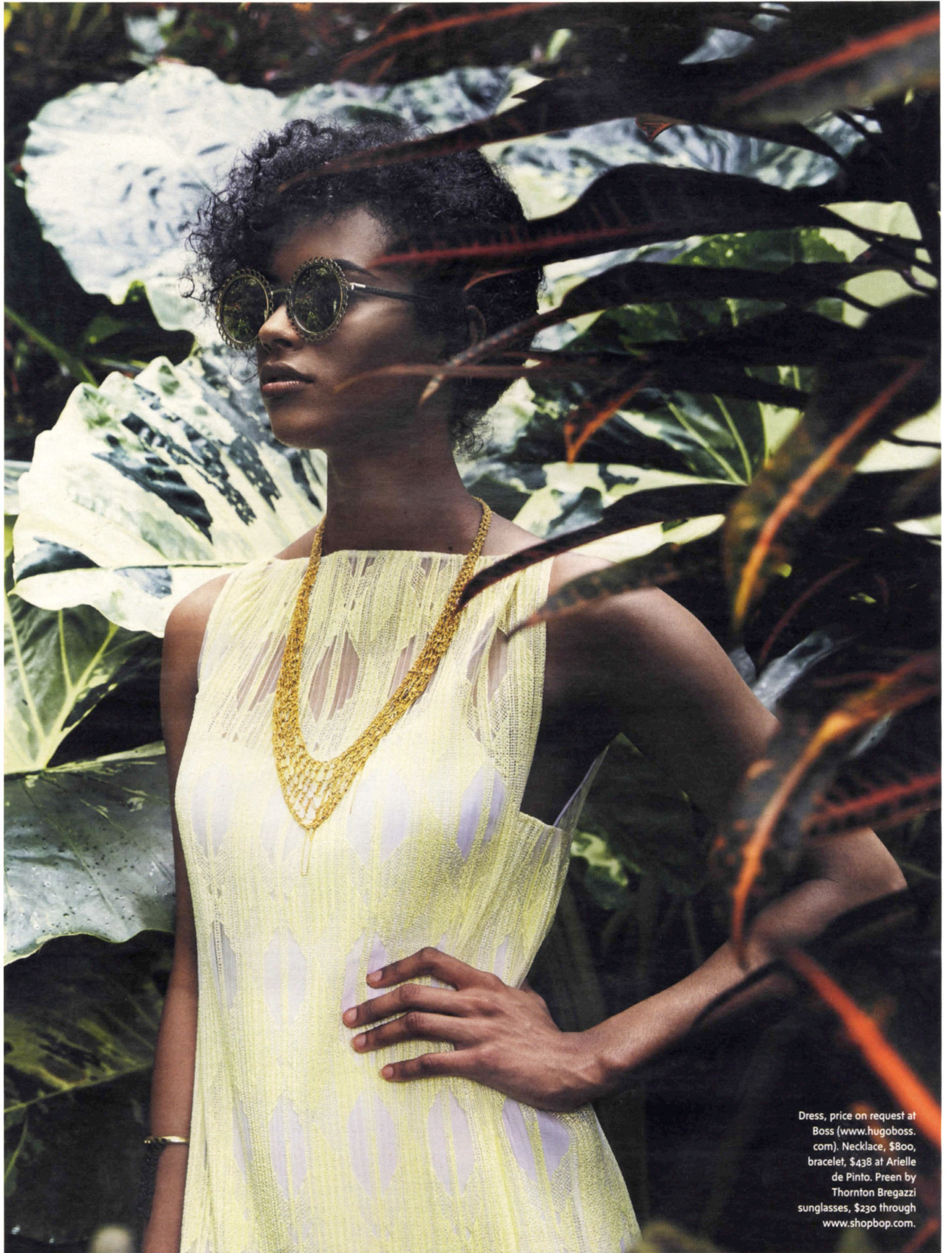
Dress, price on request at Boss ( www.hugoboss.com ). Necklace, $800, bracelet, $438 at Arielle de Pinto. Preen by Thornton Bregazzi sunglasses, $230 through www.shopbop.com .