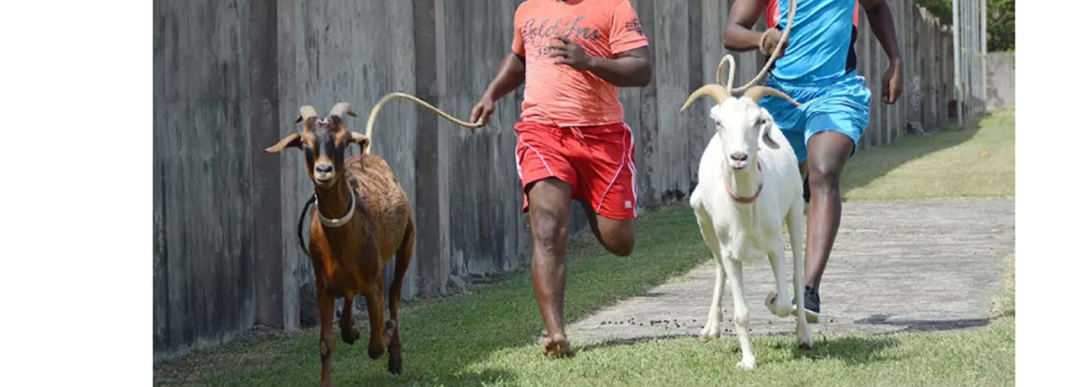
Two goats being trained in preparation for an upcoming race.

Being surrounded by the Caribbean Sea and the Atlantic Ocean means there's seafood aplenty. Besides crab and dumplings, Trim says curried conch is also an island specialty, along with cou-cou, a dish made from cornmeal.