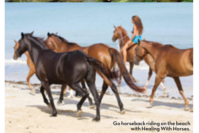
Go horseback riding on the beach with Healing With Horses.

If YOU FLY TO THE END OF THE CHAIN of islands in the Caribbean, you'll find the beautiful country of Trinidad and Tobago. While the more southern Trinidad is the larger and more populous of the two islands, Tobago is an unspoiled trove of idyllic beaches, scenic activities and tantalizing food. For the newlywed couple who wants an out-of-the-ordinary Caribbean honeymoon, Tobago should be at the top of their list—because whether you're looking for adventure or you simply want to sit back and enjoy the views, it has something for every kind of traveller. From where to stay to what to do, we have your complete itinerary for the perfect Tobago getaway.