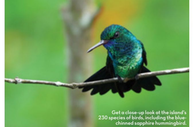
Get a close-up look at the island's 230 species of birds, including the blue-chinned sapphire hummingbird.