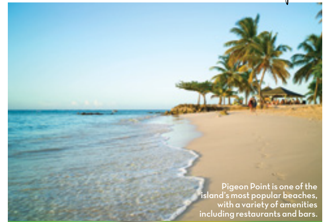
Pigeon Point is one of the island's most popular beaches, with a variety of amenities including restaurants and bars.