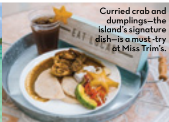
Curried crab and dumplings—the island's signature dish—is a must-try at Miss Trim's.

in Parlatuvier will lead you to Parlatuvier Falls , a waterfall with a shallow basin you can bathe in, and one of the most beautiful, tranquil spots on the island. Because it's nestled in the rainforest (a sight unto itself, with towering bamboo trees), the waterfall is a popular spot for relaxing and hanging out on a warm afternoon. If you're looking for a romantic activity that could be equally relaxing, take a horseback ride on the beach with Healing With Horses . This is the perfect opportunity to connect with your partner and the horses, and take some seriously spectacular photos.