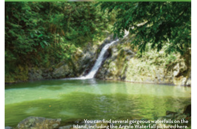
You can find several gorgeous waterfalls on the island, including the Argyle Waterfall pictured here.