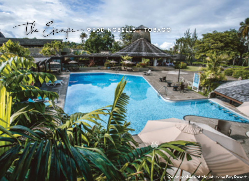
Relax poolside at Mount Irvine Bay Resort.