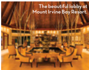
The beautiful lobby at Mount Irvine Bay Resort.

This expansive, beautiful former estate is rich in history and one of the best places to stay in Tobago. Once home to a sugar mill (you can see remnants of it at the Sugar Mill Restaurant) and a coconut plantation, it was eventually turned into a golf course, and then expanded in 1972 to become the Mount Irvine Bay Hotel & Golf Club. In 2015, the hotel underwent renovations, transforming into the Mount Irvine Bay Resort it is today. Stay in one of the luxe suites or opt for a cottage for more privacy. Plenty of space and beautiful landscaping make this a serene, calm resort where you can take a dip and enjoy a drink at the pool's swim-up bar, indulge in a spa treatment, or practice your swing at the award-winning 18-hole course. The resort can also arrange off-site activities for you, such as snorkelling, paddling, kayaking and surfing. Just steps away from the calm and shallow Mount Irvine Bay Beach, you're never too far from the water!— mtirvine.com