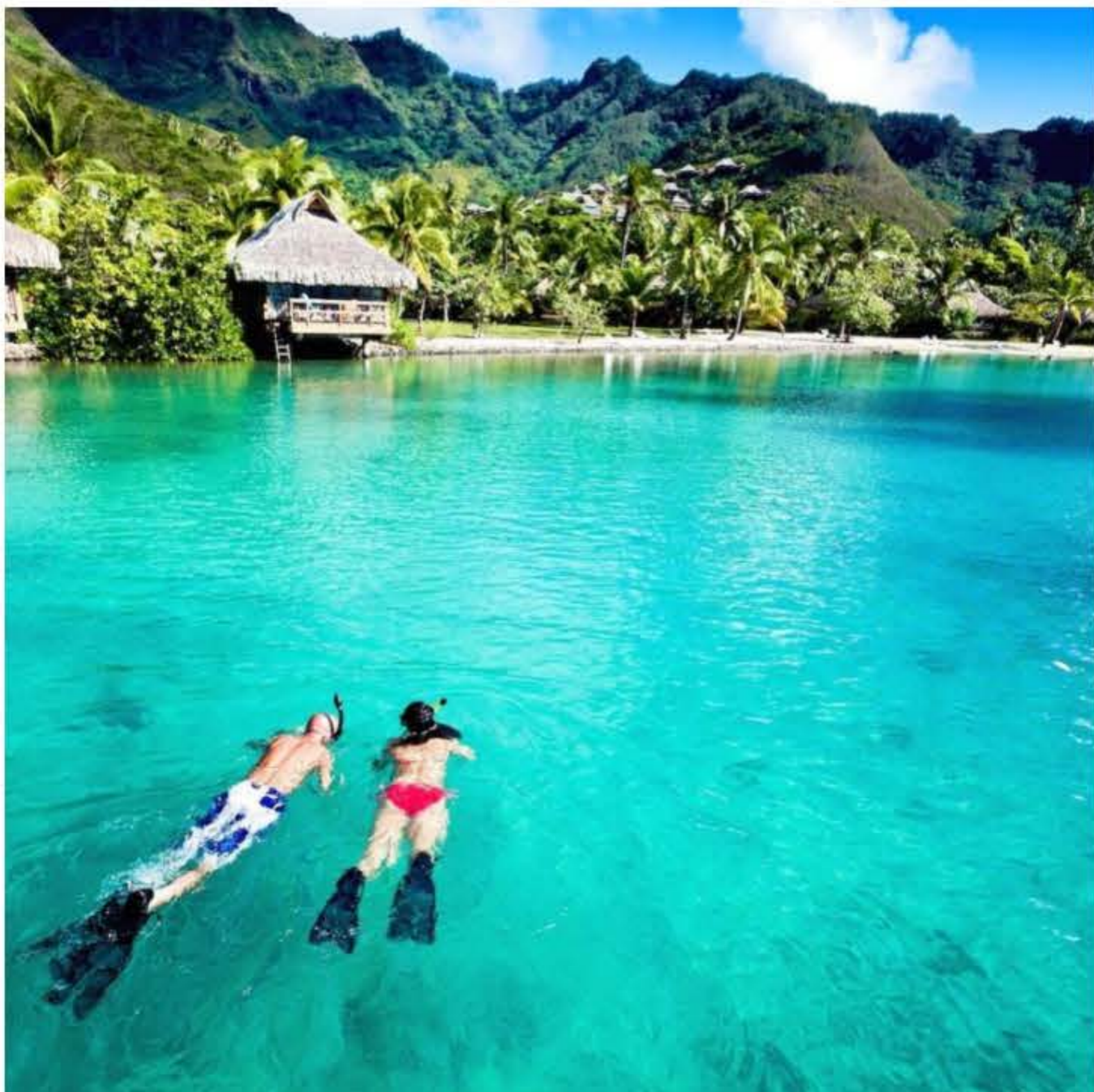
TradeWinds members snorkel in French Polynesia

But unlike the typical cruise ship scenario, you're not just another face in the crowd. Each charter, private or shared, comes with an attentive staff of two; a captain and first mate that act as scuba diving instructors, concierges, on-board chefs, and the like.