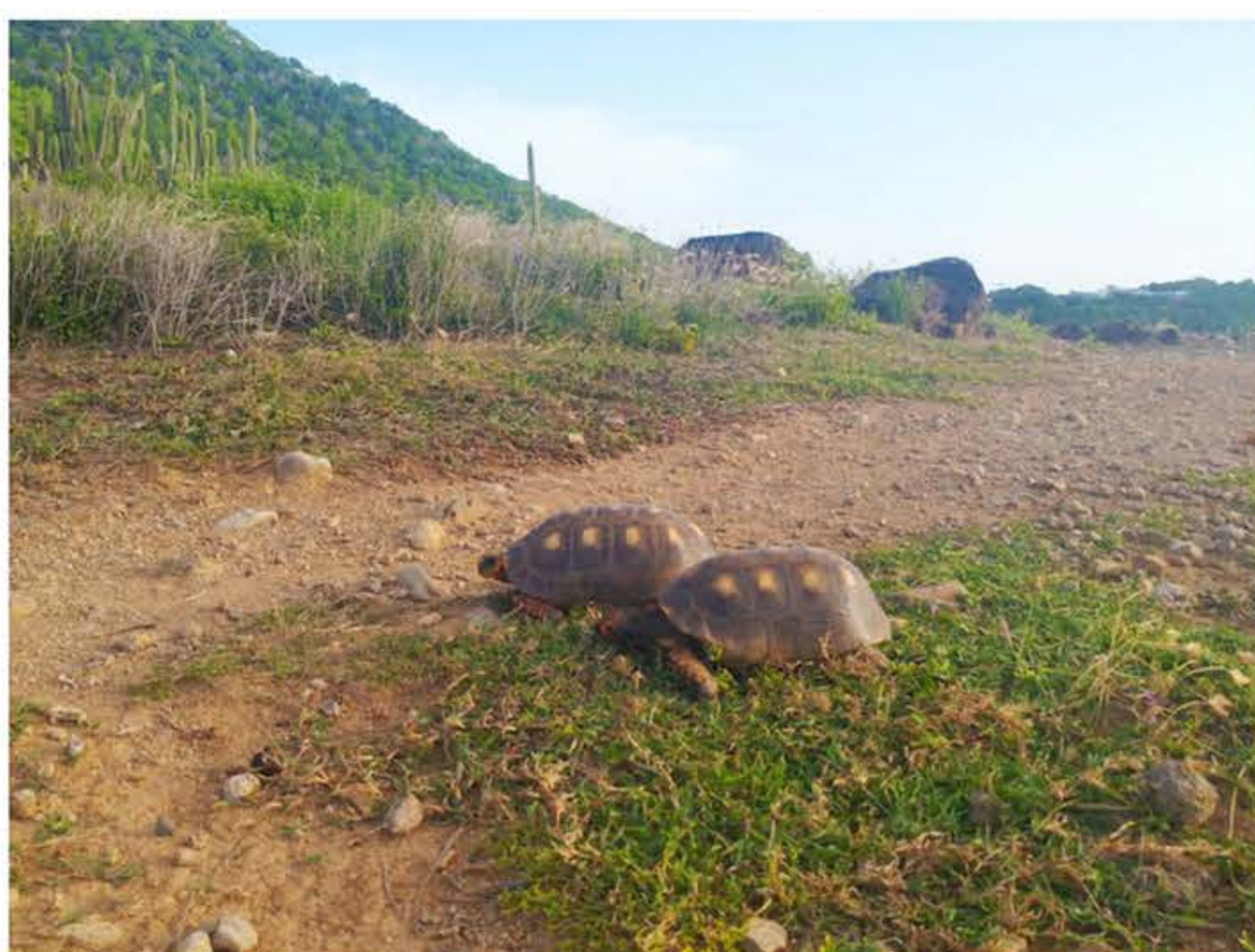
Red-footed turtles wander Colombier Beach

And I can personally attest to the magic that is a TradeWinds vacation. I had the pleasure of hopping aboard a charter that sailed around Sint Maarten, Anguilla and Saint Barthélemy. The trip started on the the Dutch side of Sint Maarten, where I met the crew and spent the night before taking off into the beautiful ocean. A group of 10 — a mixture of longtime TradeWinds friends and fresh faces — made way to a number of islands, including Sandy Ground for tropical cocktails at the famous Elvis Beach Bar, Colombier Beach where we hiked alongside red-footed tortoises outside the Rockefeller's abandoned mansion, Gustavia for world class shopping while on the lookout for celebrities, Grand Case for 4-star dining, and Tintamarre Island for snorkeling with stingrays, turtles and colourful fish.