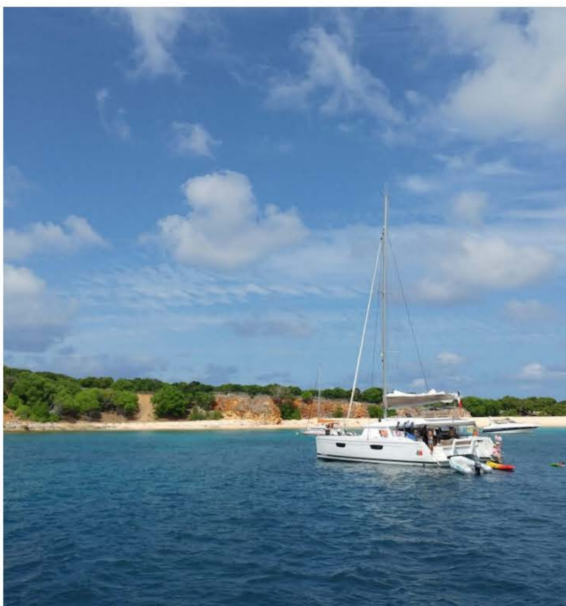
A TradeWinds pit stop

Life on board a TradeWinds charter also allows for more freedom and flexibility. On your trip, you'll visit well-trodden spots, hidden swimming coves and all the romantic isles in between — sans swarms of tourists — where you can swim yacht-side, snorkel with magical sea creatures, explore, paddle board, kayak, hike and more, all at your leisure.