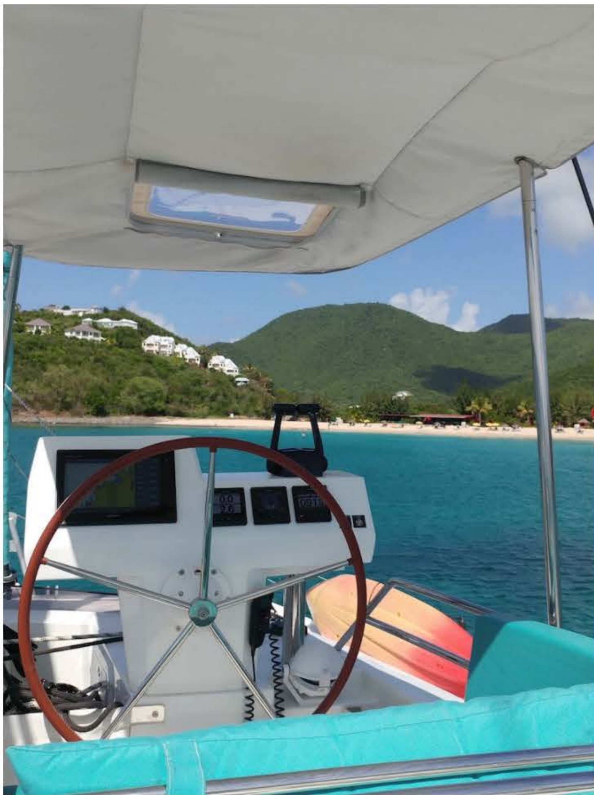
The Captain's seat