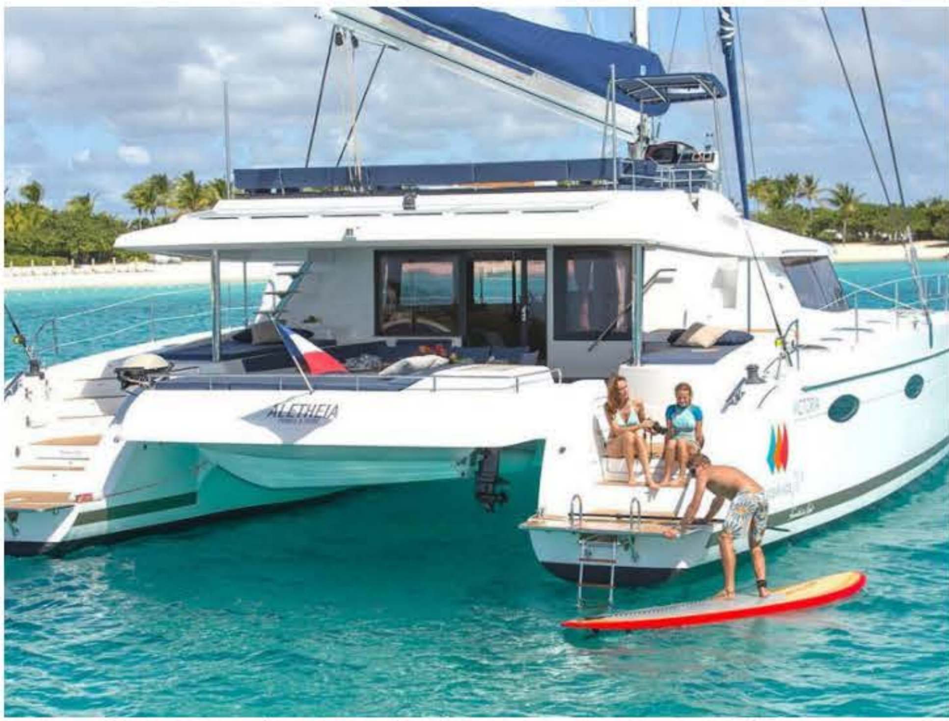
Just one of the yachts in TradeWinds' fleet

To most, sailing across the turquoise waters of an open ocean for days at a time may seem like an elusive dream; one reserved for celebrities like Jay Z and Beyonce, and the one percenters of the world. But an idyllic vacation with postcard-esque views isn't as far out of reach as one might think — especially with the help of TradeWinds .